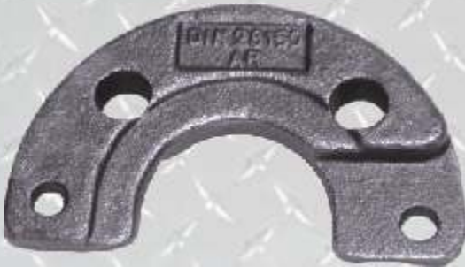
FINGER / GUARD