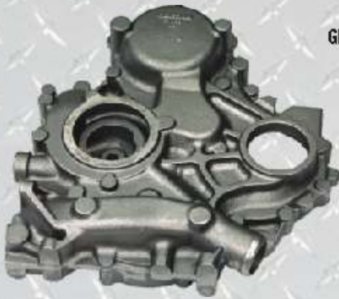
GEAR CASING (CAST)